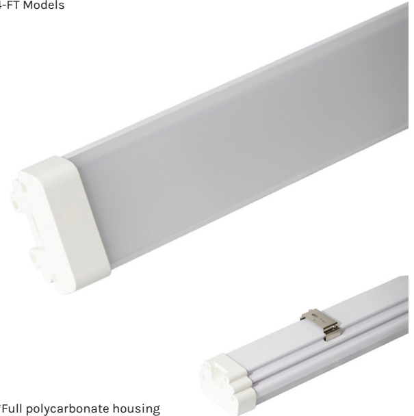
*Full polycarbonate housing