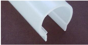
FROST TUBE LENS 396L.ACR.REG-FST.,875" wide x.1.25"tall, lengths 48" or 96" Fits 369 base, Acrylic natural frost tube lens