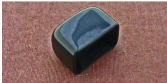
BLACK OVAL END CAP END.OVAL.BLK., 875" wide x 50" tall, fits die 391, Acrylic, black end cap