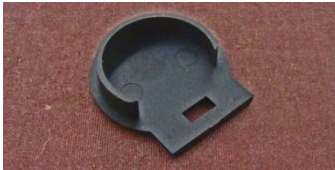
BLACK ROUND END CAP END.BLK, 1.25" diameter round x 0875" wide square, fits die's 370 & 396, Polycarbonate, black end cap